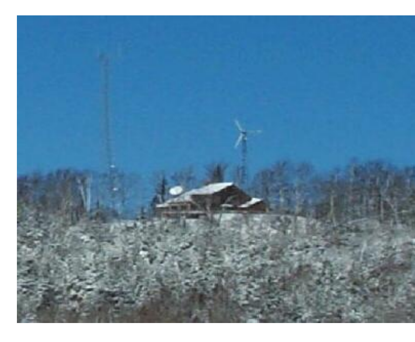
Viewable from Portage. My kind of place. My guess is t windmill was doing about 100RPM.