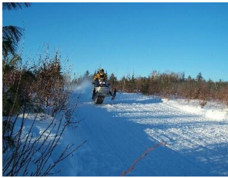
Sure the wife's sled will fly.

(more than you can count on one hand signal) – one guy puts his shield up "There's a whole bunch behind me" he says. I don't think it's a stretch to say there was 40 sleds in that group. My kind of town!! 1186 miles in all. What a ride!