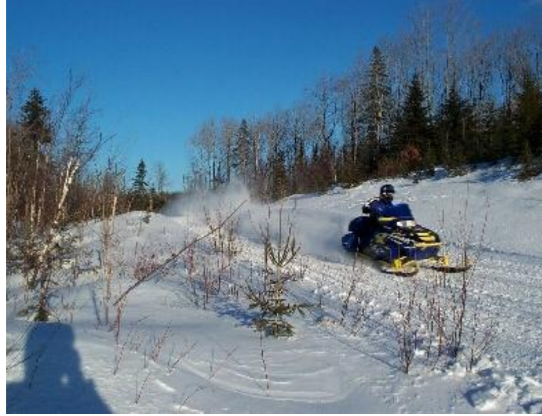
Time to spare, so we attempt some action shots.