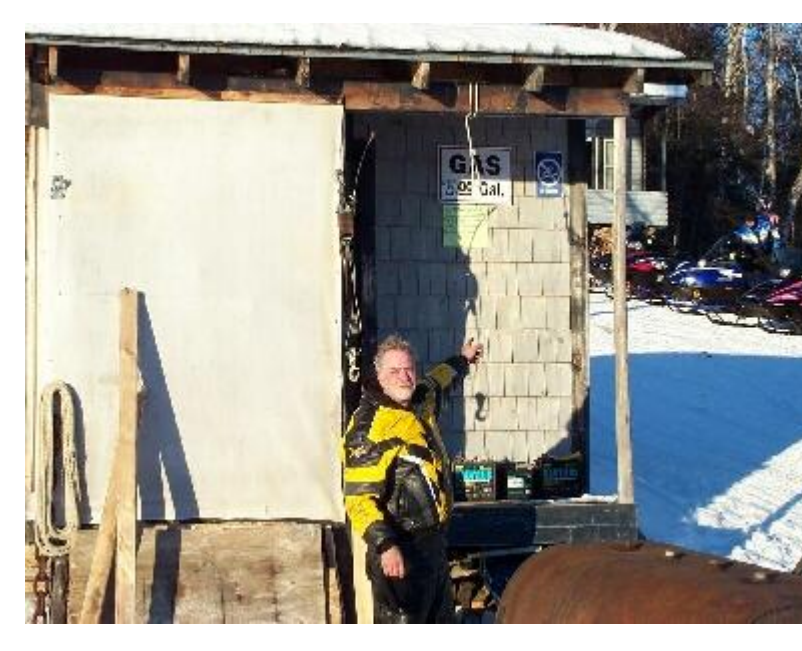
.....You Don't need Gas.