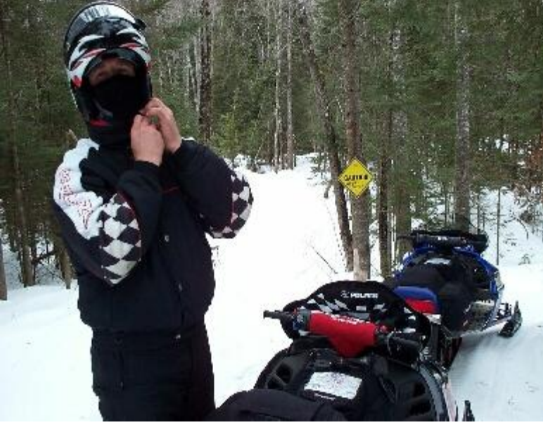
What's that say? WATER CROSSING?