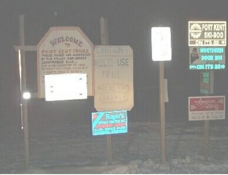
Need I Furnish a Caption?

Now running a bed and breakfast and all, and how