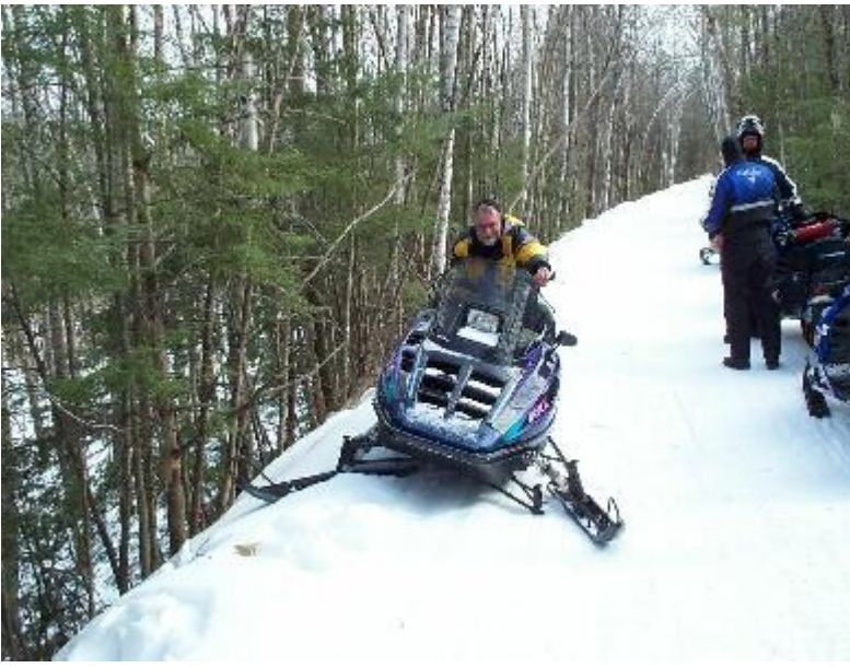
Never let a crazy Frenchman ride your sled.