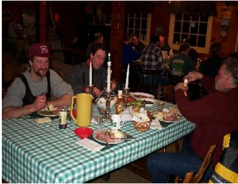
Dinner at Mount Chase Lodge. Cut it out.