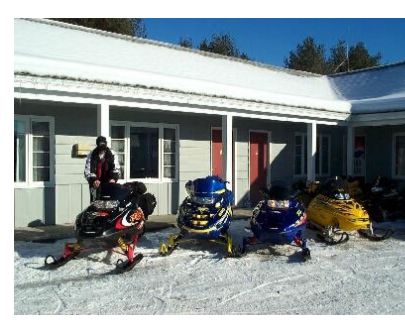
Bingham Motor Inn