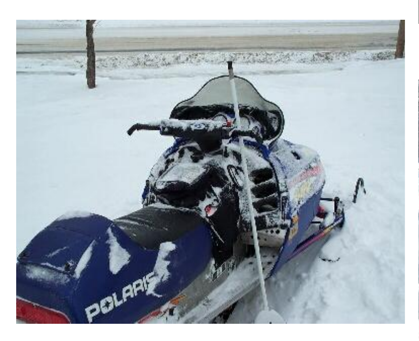
Not your recommended start on a COLD morning. Mental note: Next time find a way to fit the cover!

Well, you see it's like this. We wake up to see school closings pretty much from Greenville north (not Fort Kent however), and we get up and see our sleds with a solid coat of crusty snow. We talk it over breakfast and decide to rename ourselves "Team Fort Kent" instead of "Team Matawaska" (too bad, the former sounds a lot catchier), and head back to Shin Pond. Getting there in the day light had a lot of appeal.