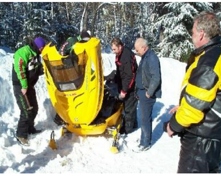
Incidental Entertainment...SkiDoo 0