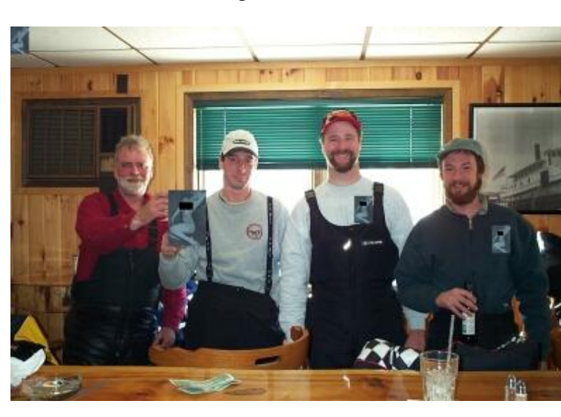
We'll Never Tell What We Were Really Thinking