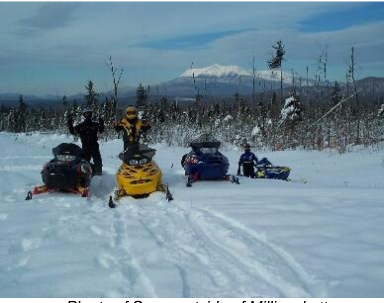
Plenty of Snow outside of Millinockett.

This is the part you have to do so you can say you