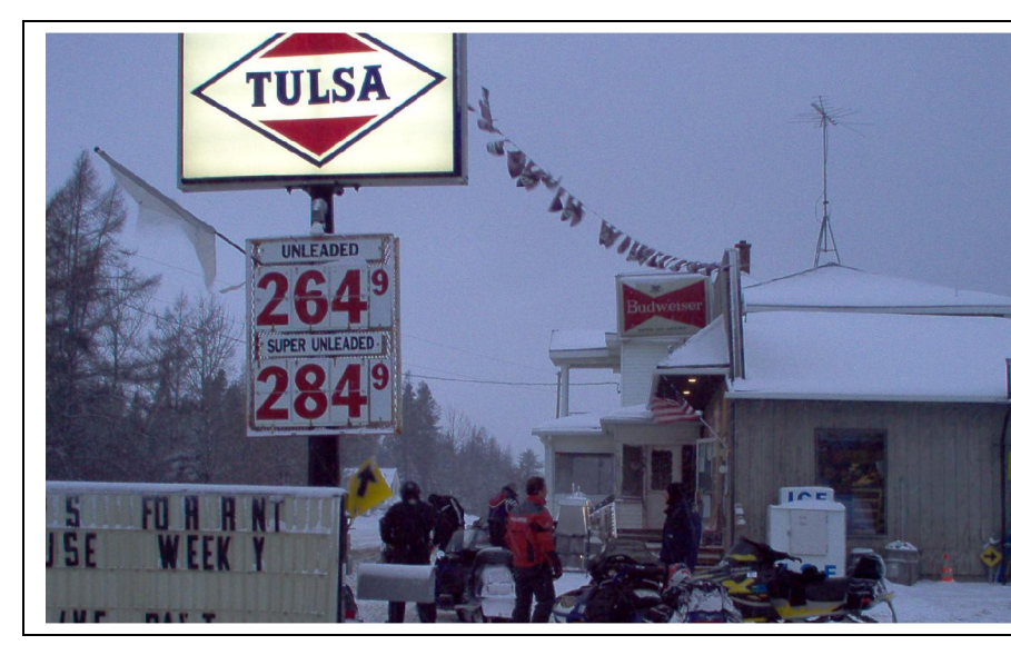
Heaven? Well....Yeah baby!!!!!!

We took ITS 90 to 105 where I thought I was in for major trouble. I hit empty with no gas in sight. Hill after hill after hill, with just another hill. Made it though, and put on quite a dancing spectacle at the pumps! Found Gateway motel NP.